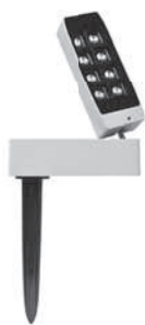
AC037 EARTH SPIKE